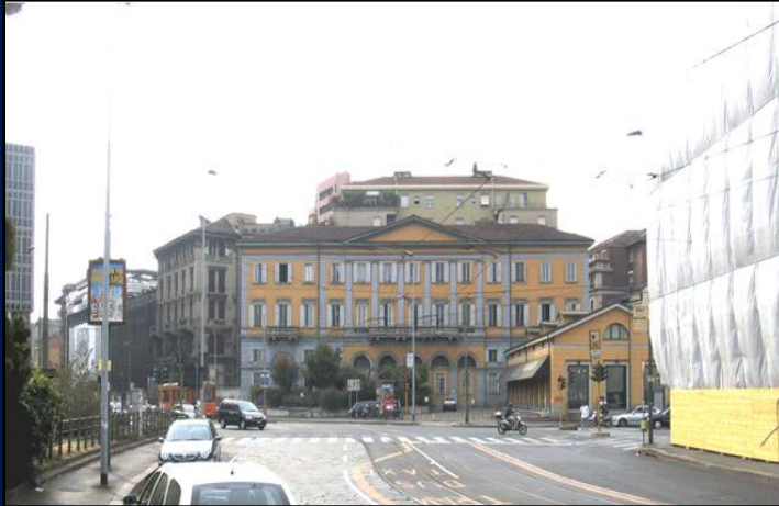
Milano - Fashion Hotel - 3.444 mq. - 80 stanze