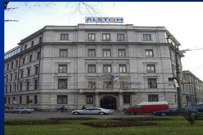
Milano - Direzionale - 19.000 mq.