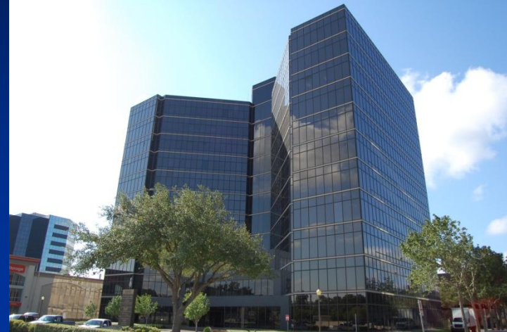
Houston - Direzionale/Residenziale - 18.000 mq.